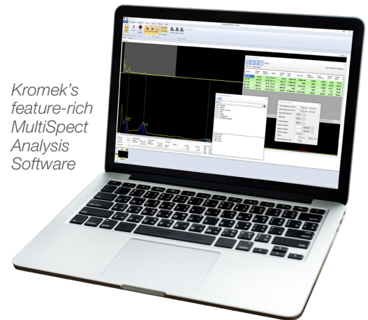
Kromek's feature-rich MultiSpect Analysis Software

MultiSpect Analysis ® software is written specifically for Kromek's GR1 and GR1-A for use with Windows ® 10-based PCs or tablets. The GR1 ® comes with K-Spect ® , Kromek's entry-level software which is free of charge to download. Go to: https://tinyurl.com/KSPECT