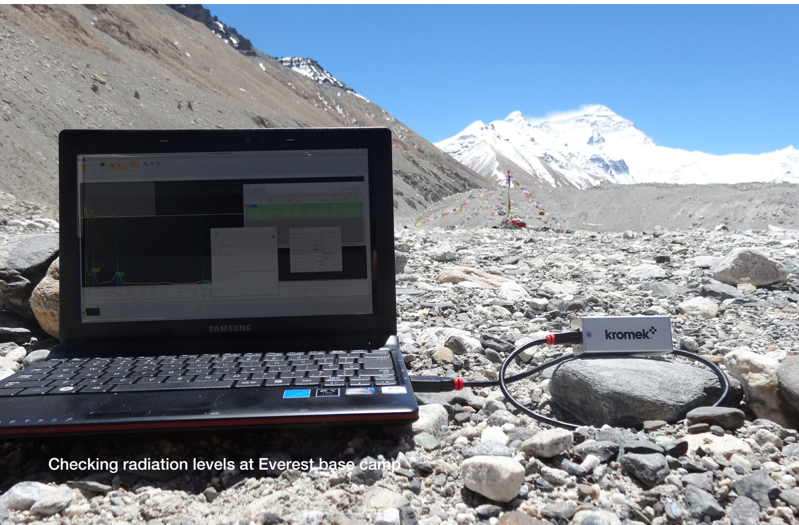
Checking radiation levels at Everest base camp

Gate Input: used to suppress pulse height output via the USB interface to K-Spect for anticoincidence. Energy and timing outputs are unaffected.